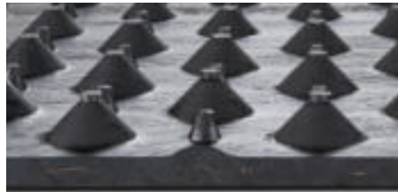
Specially designed stud geometry.

The comfort covering N33 is characterized by studs of different heights on the underside. This special stud geometry provides even more comfort for the cow through its cushioning function.